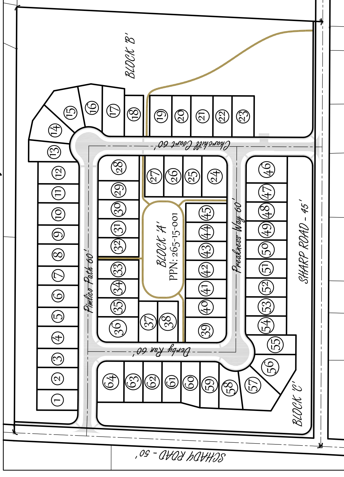
SITE MAP 1"=175'